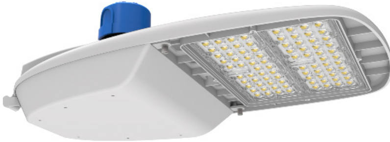
Shown with photocell (Not Included)